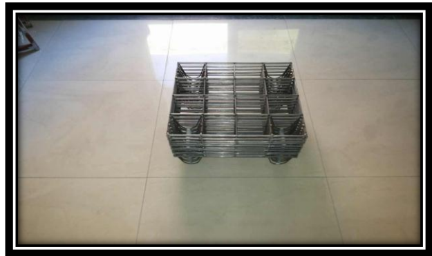
Ten pallets in storing